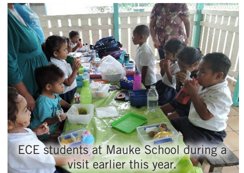
ECE students at Mauke School during a visit earlier this year.