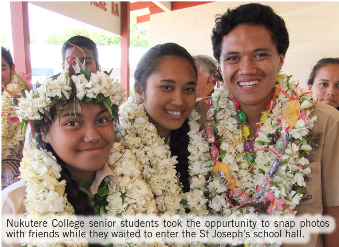
Nukutere College senior students took the opportunity to snap photos with friends while they waited to enter the St Joseph's school hall.