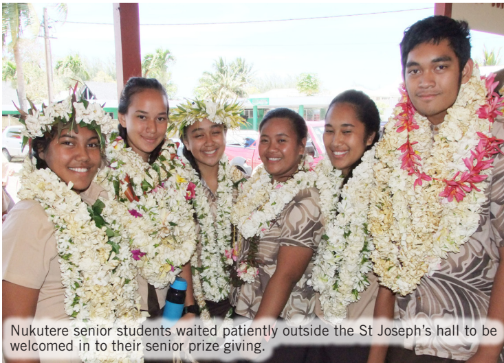
Nukutere senior students waited patiently outside the St Joseph's hall to be welcomed in to their senior prize giving.