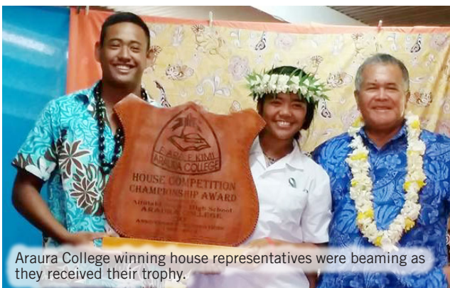
Araura College winning house representatives were beaming as they received their trophy.