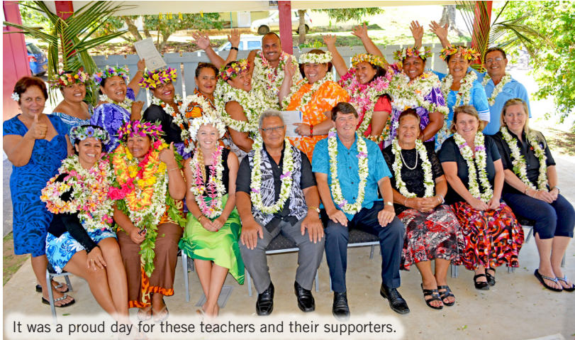
It was a proud day for these teachers and their supporters.

“ We don’t have a job, we have a passion”, was one of many comments that resonated with the gathering of teachers and supporters last Friday for the Annual Teachers Awards ceremony. It was the teachers turn to be acknowledged and rewarded for their hard work throughout the 2015 academic year both as teachers and in some cases as students.