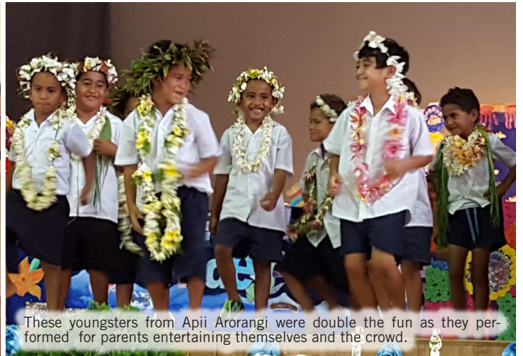
These youngsters from Apii Arorangi were double the fun as they performed for parents entertaining themselves and the crowd.