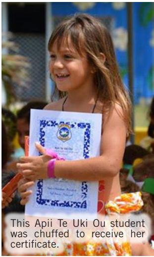
This Apii Te Uki Ou student was chuffed to receive her certificate.