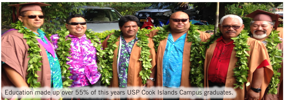
Education made up over 55% of this year's USP Cook Islands Campus graduates.