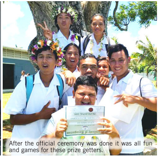
After the official ceremony was done it was all fun and games for these prize getters.