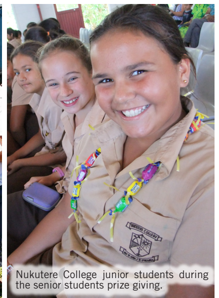
Nukutere College junior students during the senior students prize giving.