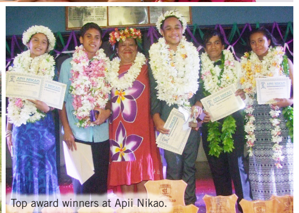
Top award winners at Apii Nikao.