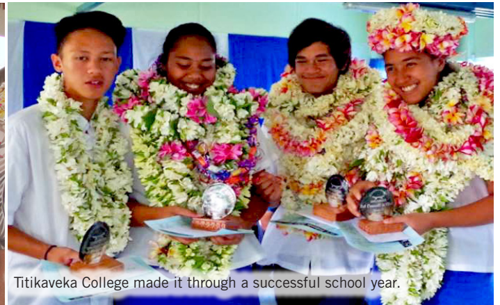
Titikaveka College made it through a successful school year.