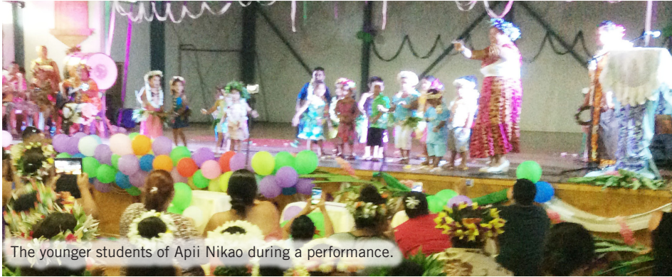
The younger students of Apii Nikao during a performance.

The Ministry of Education would like to congratulate all students on their achievements and wish them and their families a very Merry Christmas and a safe and happy New Year. Here are a collection of images from ceremonies across the Cook Islands.