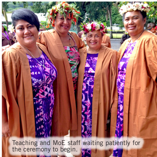
Teaching and MoE staff waiting patiently for the ceremony to begin.

The Ministry of Education has for a number of years, been in partnership with the University of the South Pacific on a project to progress teachers towards obtaining their first undergraduate qualification up to the degree level. The Ministry financially supports the teachers by covering course costs. For those who already have a degree, the Ministry offers support by covering 50% of the course fee for further education.