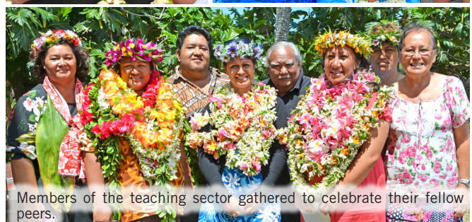
Members of the teaching sector gathered to celebrate their fellow peers.