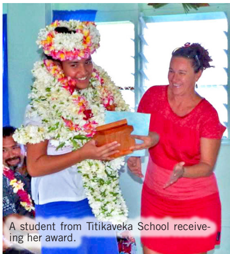
A student from Titikaveka School receiving her award.