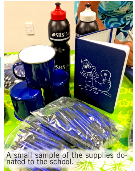
A small sample of the supplies donated to the school.