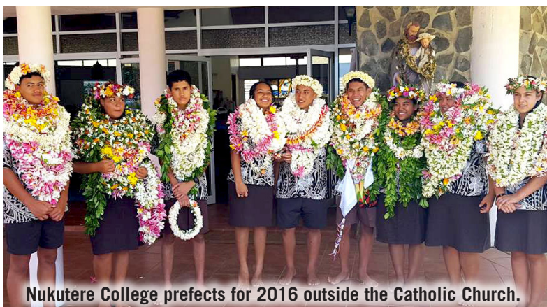
Nukutere College prefects for 2016 outside the Catholic Church.