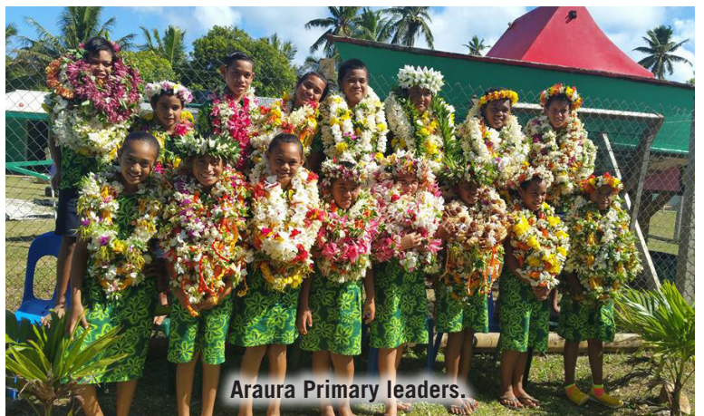
Araura Primary leaders.