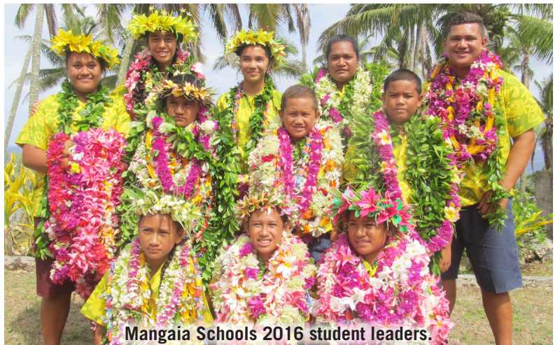
Mangaia Schools 2016 student leaders.