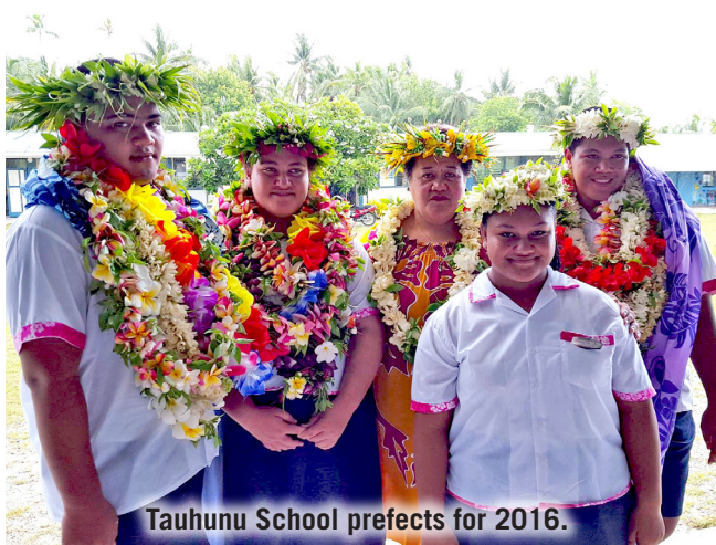
Tauhunu School prefects for 2016.