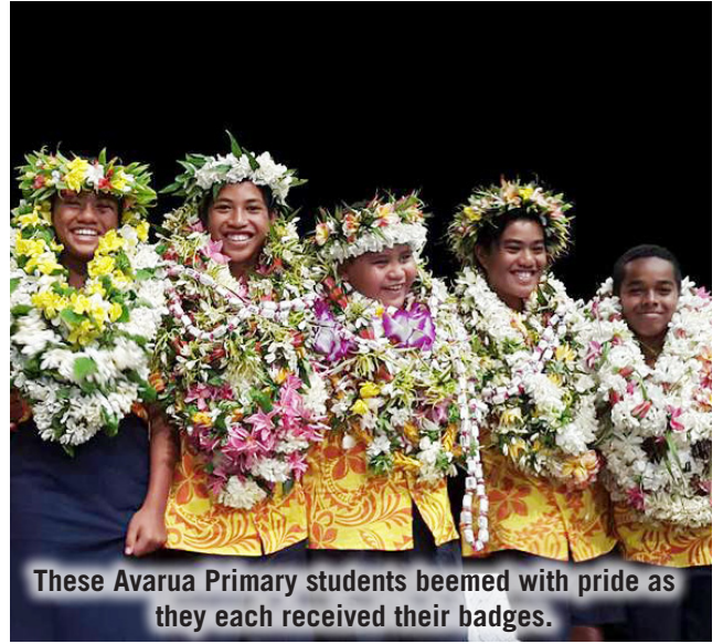
These Avarua Primary students beamed with pride as they each received their badges.