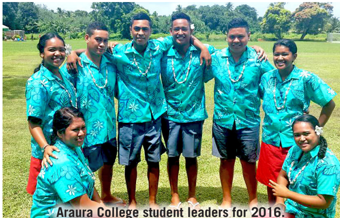
Araura College student leaders for 2016.

Around the Cook Islands handpicked students were given the honour of becoming student leaders and student council members to their peers. These chosen few have been tasked to uphold their schools beliefs and practices amongst their peers for the rest of the school year and are challenged to set an example for their underclassmen both in and outside of the classroom. Here is a collection of images from schools including the Pa Enea. Congratulations to all student leaders and council members.