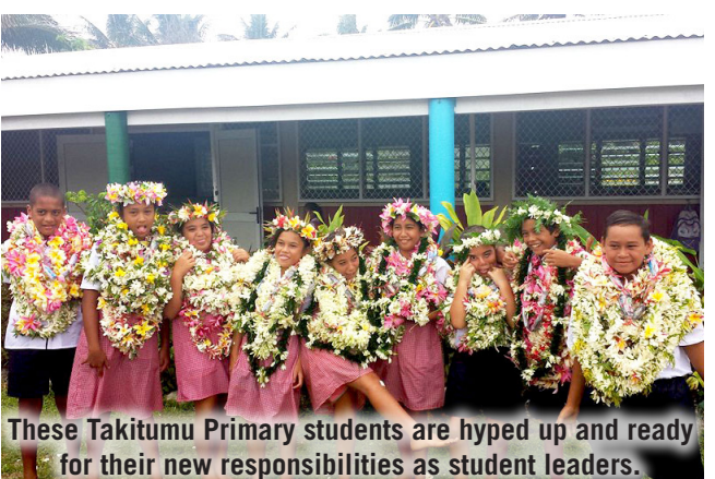
These Takitumu Primary students are hyped up and ready for their new responsibilities as student leaders.