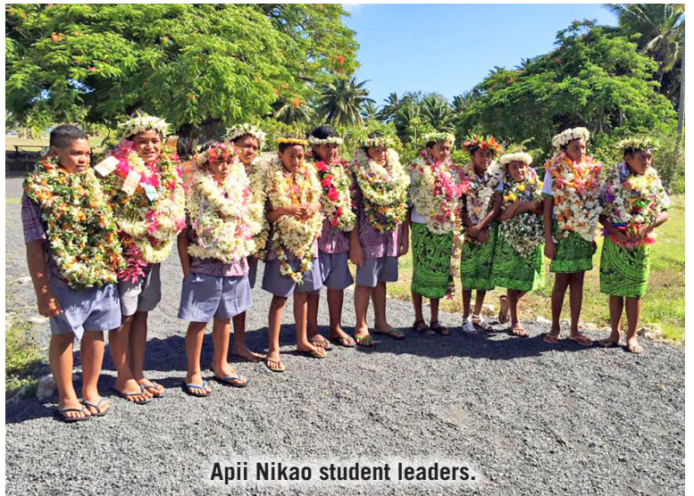
Apii Nikao student leaders.