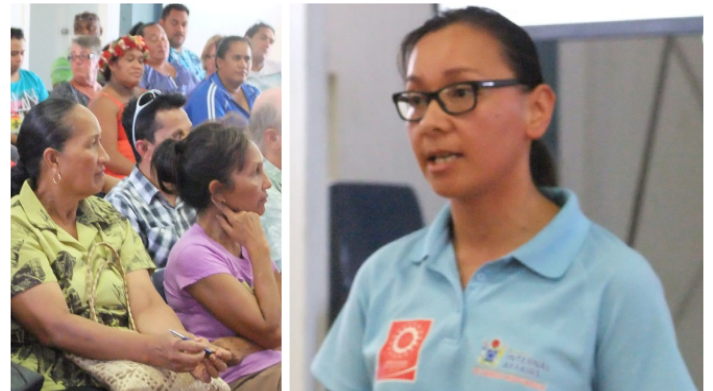
All eyes were on the Secretary of Internal Affairs during the presentation.

A further area of discussion was on whether teachers