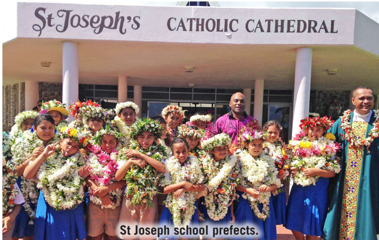
St Joseph school prefects.