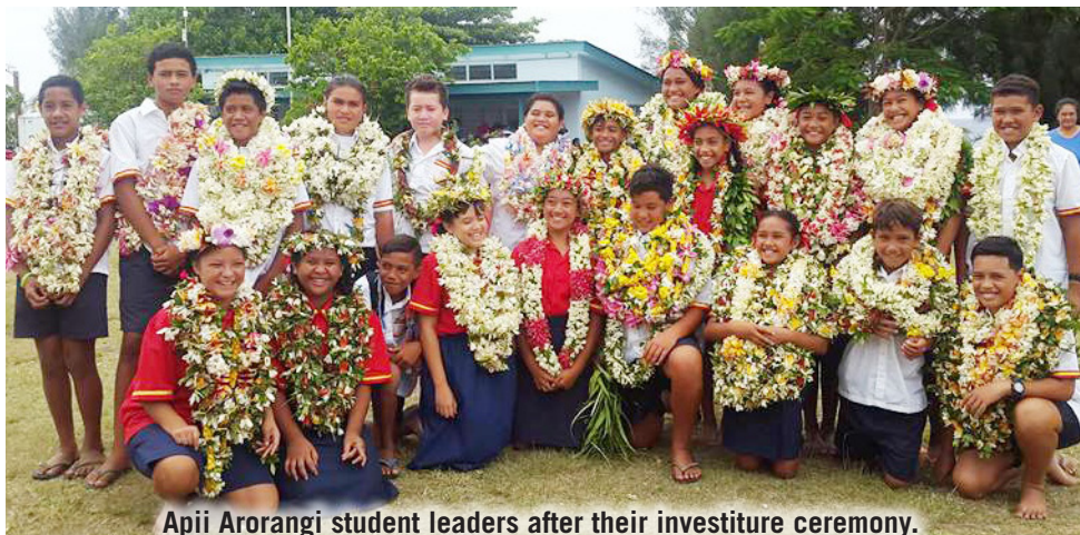
Apii Arorangi student leaders after their investiture ceremony.