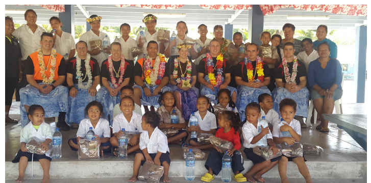
Ruamanu students and the mayor of Manihiki pose with visiting members of the New Zealand army.