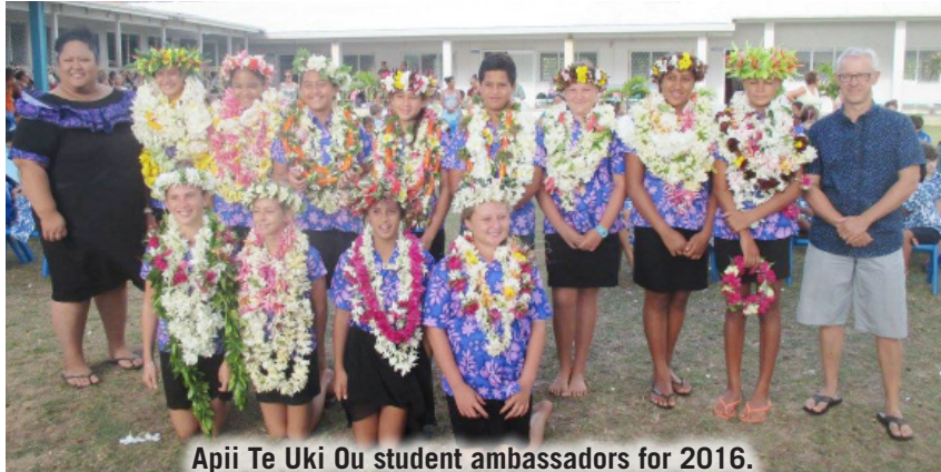
Apii Te Uki Ou student ambassadors for 2016.

Around the Cook Islands handpicked students were given the honour of becoming student leaders and student council members to their peers. These chosen few have been tasked to uphold their schools beliefs and practices amongst their peers for the rest of the school year and are challenged to set an example for their underclassmen both in and outside of the classroom. Here is a collection of images from schools including the Pa Enea. Congratulations to all student leaders and council members.