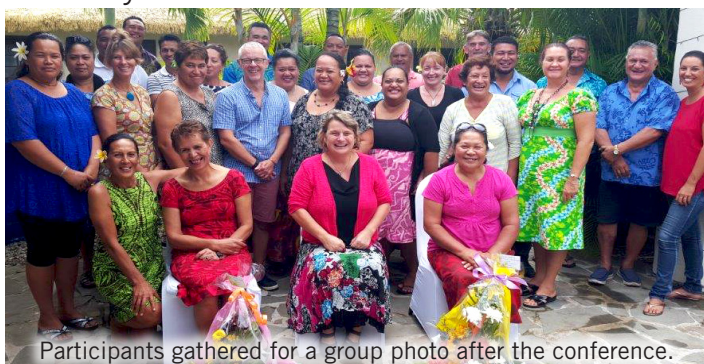
Participants gathered for a group photo after the conference.