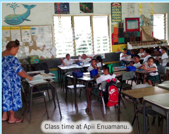
Class time at Apiti Enuamanu.

school year. New to the student information system, staff at Apiti Mauke were taken through the basics of Edge ensuring they can log in, take attendance and make note of shortcut widgets and school announcements.