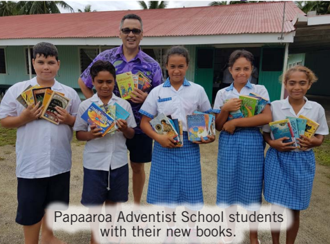
Papaaroa Adventist School students with their new books.